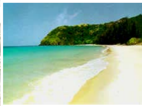
Description of itinerary: SIEM RIEP - PHNOM PENH -SIHANOUKVILLE BEACH −---8 DAYS / 7 NITES -----